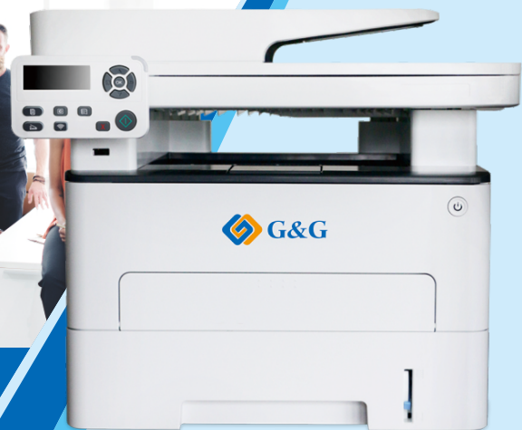
P4100/M4100 Series Monochrome laser printer