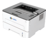
P4100 Series Monochrome laser single-function printer